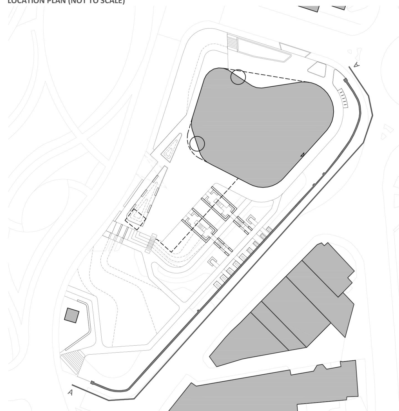
LOCATION PLAN (NOT TO SCALE)